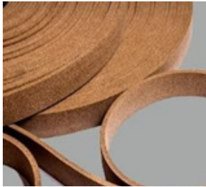
COEK GASKET BELT 25 MTR ROLL 40*4, 40*5, 50*5 ETC...