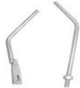
ARCING HORNS 250A/630A