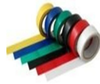
ELECTRICAL INSULATION TAPE