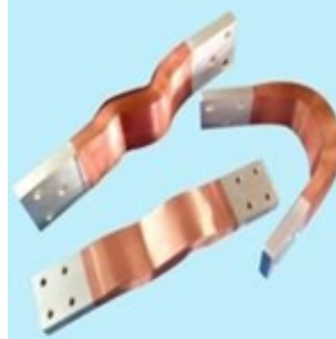
LAMINATED COPPER FLEXIBLE JUMPER