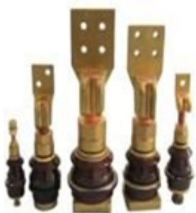
LV BUSHING WITH METAL PART SET