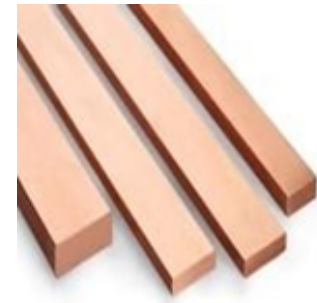
LV COPPER BUSBAR