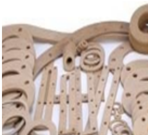
CORK GASKET KIT LV+HV SET -19 NOS 250AMP