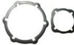
BUSHING CLAMP 250A/630A/2000A/3150