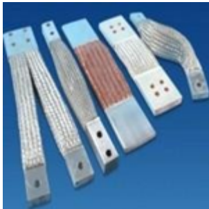
FLEXIBLE BUSBAR CONNECTORS