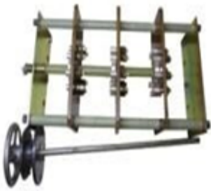
OFF LOAD TAP CHANGER